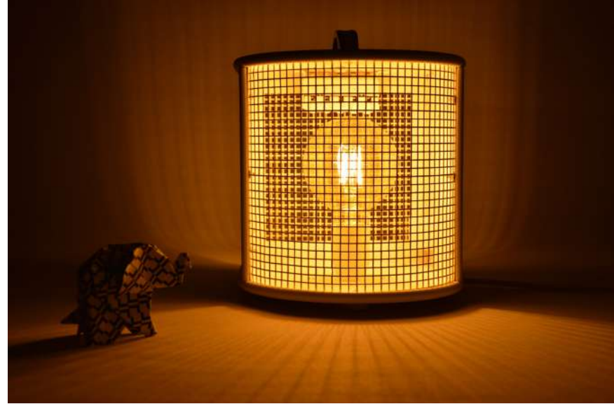
ArtJL211 lamp from a Thermowind heater - 1960s