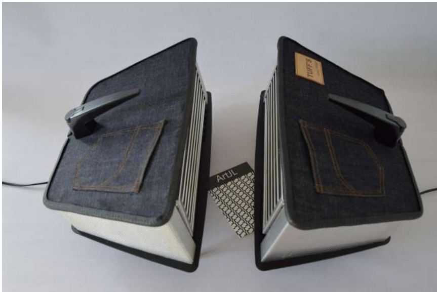
ArtJL141 & 142 lamps from Calor heaters - 1970s Collaboration with the French jeans brand Tuffery