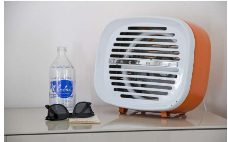
ArtJL230 lamp from a Thermor heater - 1960s

If you would like me to advise you in your search for lighting, I invite you to contact me. I will be delighted to support you in your projects, always as exciting as each other. »