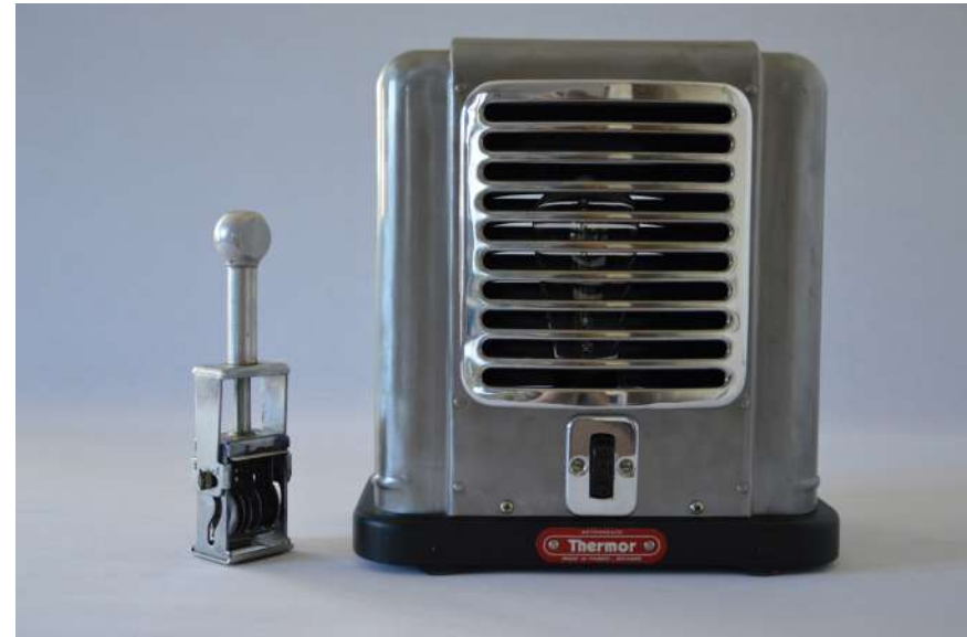
ArtJL226 lamp from a Thermor heater - 1950s