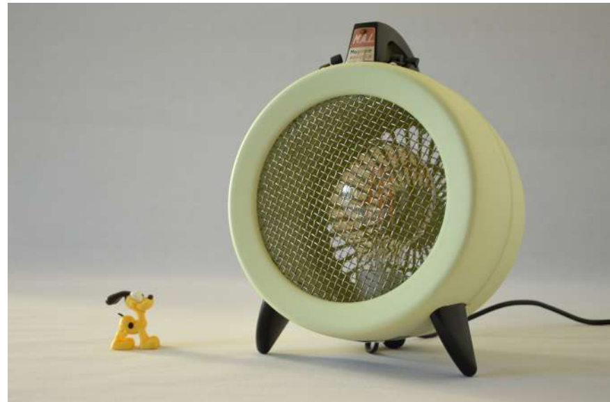
ArtJL219 lamp from a Magic Air heater - 60s