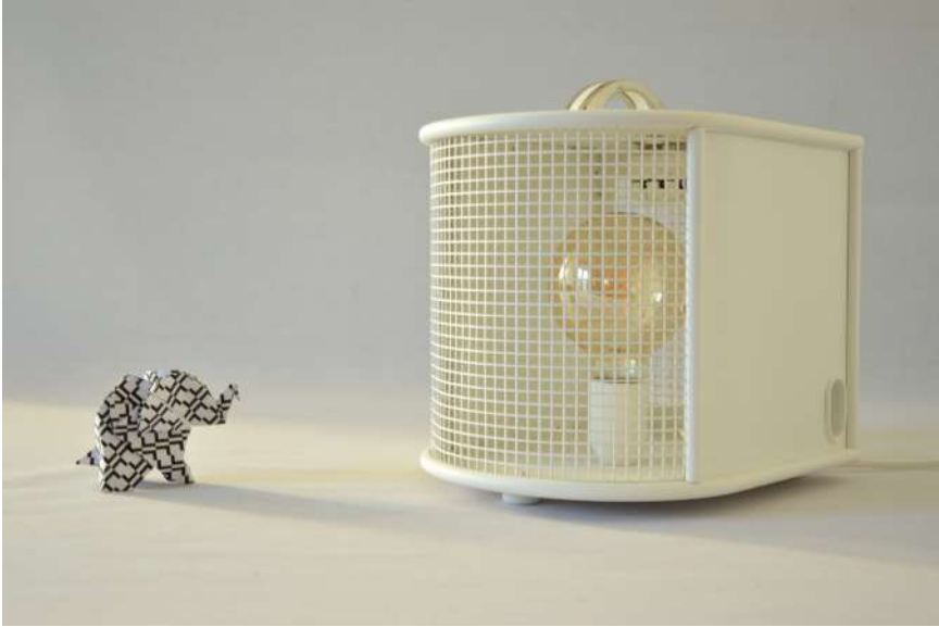
ArtJL211 lamp from a Thermowind heater - 1960s