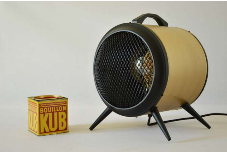
ArtJL207 lamp from a Philips heater - 1970s