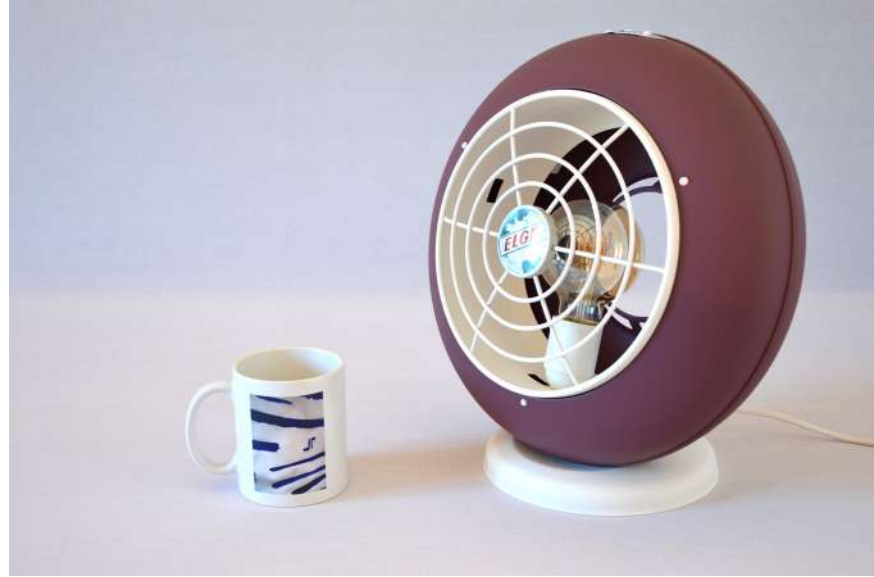
ArtJL240 lamp from an Elge heater - 1960s