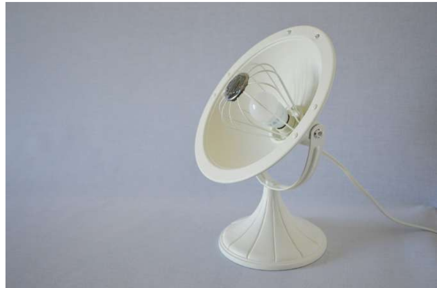
ArtJL245 lamp from Calor heater - 1950s