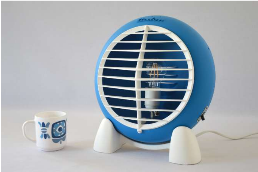
ArtJL183 lamp from a Calor heater - 1960s