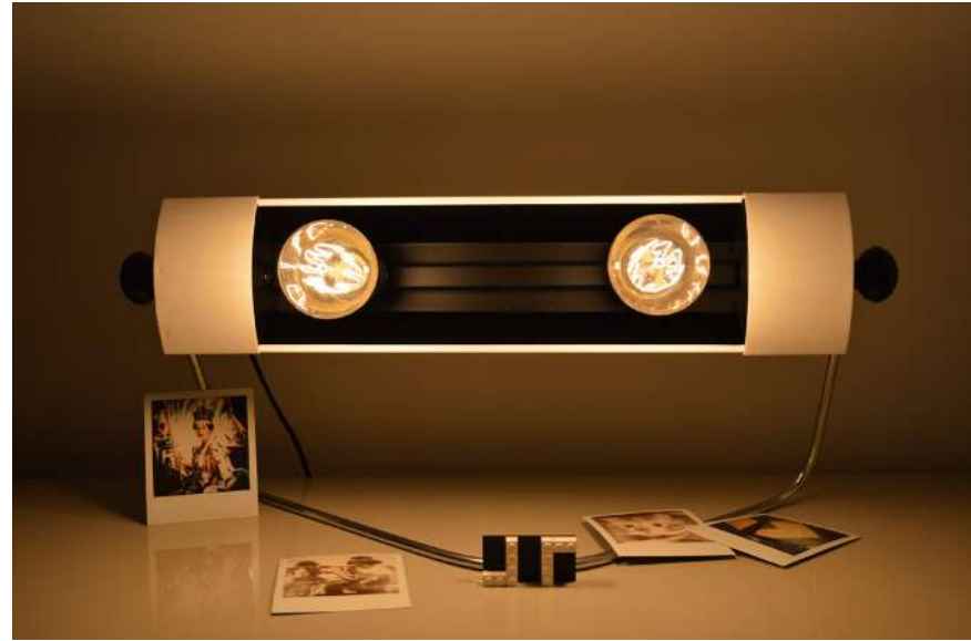
ArtJL157 lamp from a PRL heater - 1970s