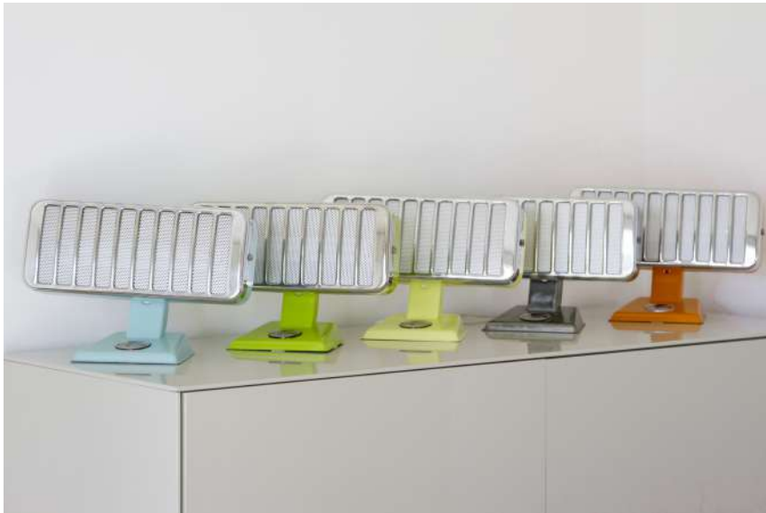
Set of lamps from Thermor heaters - 60s