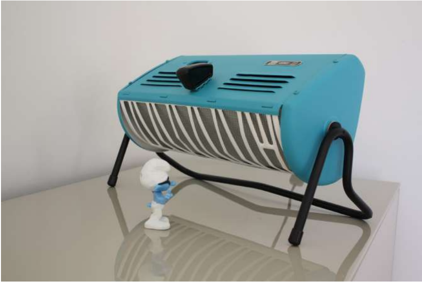
ArtJL58 lamp from a Philips heater - 1970s