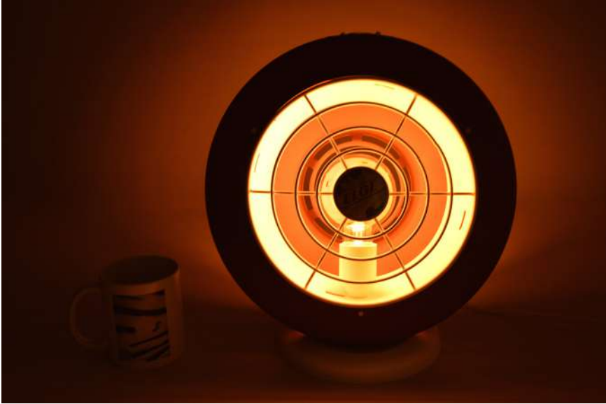
ArtJL240 lamp from an Elge heater - 1960s